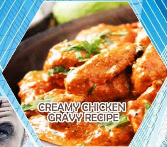
CREAMY CHICKEN GRAVY RECIPE

Time sure does fly when you're busy and having fun while working. Christmas is just around the corner and one can say that it's been a great year so far. We always aim to bring you something new and fresh in every edition and we've got great news for all you soccer fans, with the FBC bringing you free to air selected live matches of the UEFA Champions league on our FBC Sports Channel. You'll be excited to know that we're also giving away a house and cash giveaways via our radio stations so stay reading to find out who how you can go into the draw to win these awesome prizes.