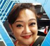
RADIO TOP 5 SONGS